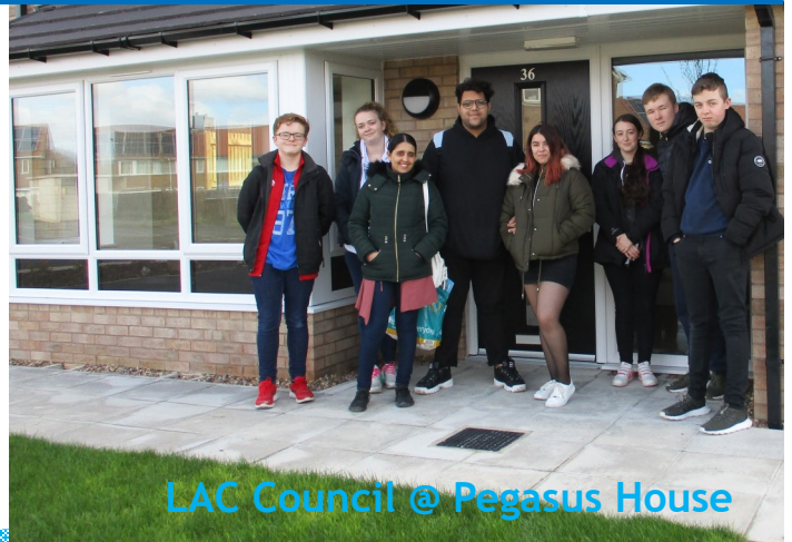
LAC Council @ Pegasus House