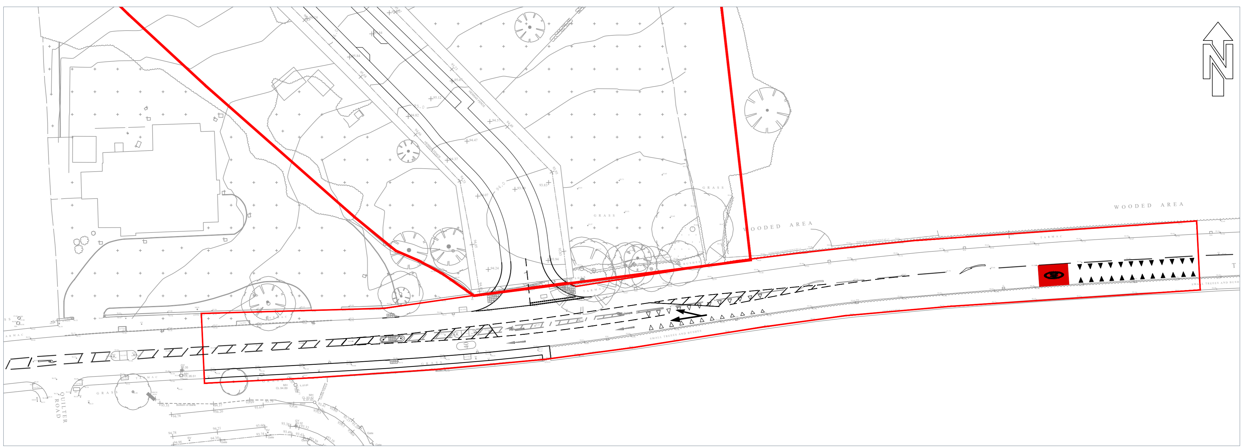
S278 RED LINE BOUNDARY (SCALE 1:500)