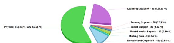
Carers Aged 50+ By Primary Support Reason of Customer

There are 387 carers aged 50 and over who support a service user with a learning disability