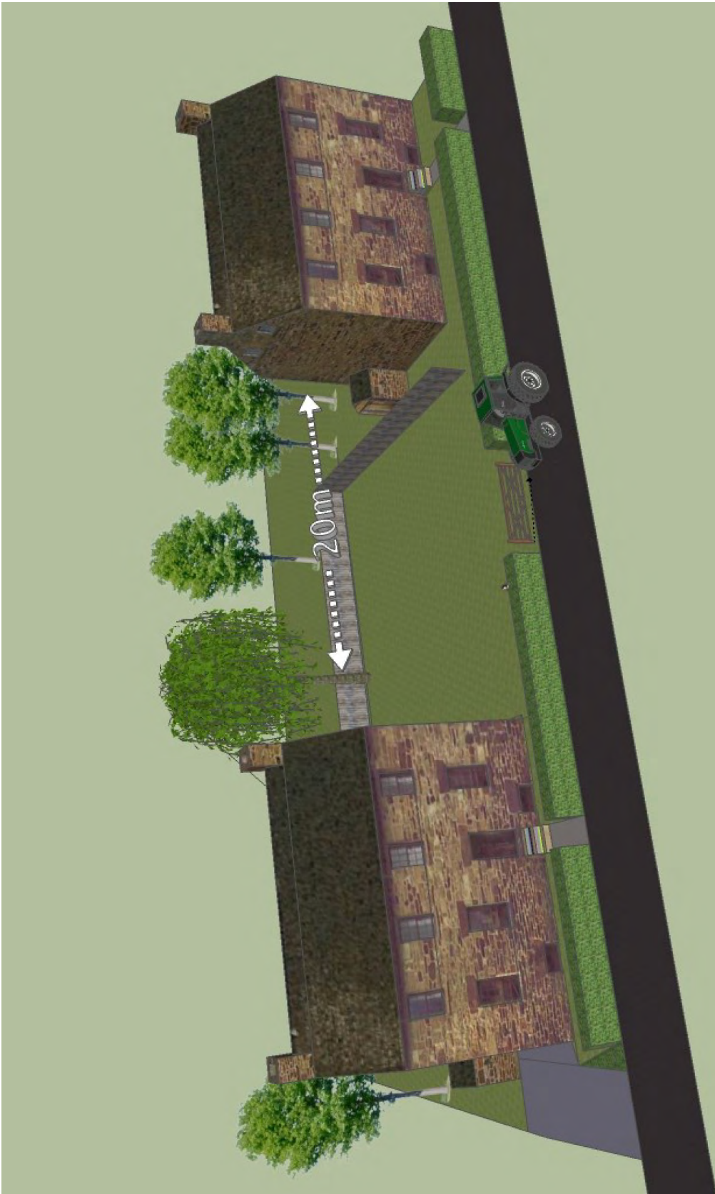
Figure 2 Example of an infill gap