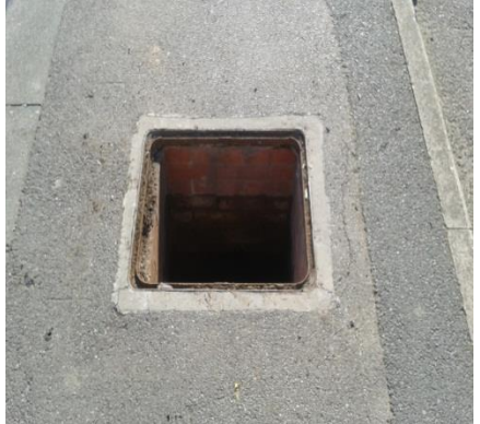
Missing Chamber Cover