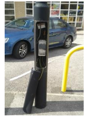
Lighting Column access cover Carriageway Collapse Removed exposing cables

Defects will be made safe at the time of the inspection, if reasonably practicable. In this context, making safe may constitute the Highway Inspector parking a vehicle in such a manner as to protect users of the highway from the defect, or by maintaining a presence to advise highway users accordingly. The emergency call procedures will be adopted by the Highway Inspector in circumstances where it is not possible to make safe the highway at the time of inspection, thereby ensuring that appropriate resources are mobilised by the Highway Delivery Team to make the defect safe. Examples of typical Cat 'A' defects are shown below.