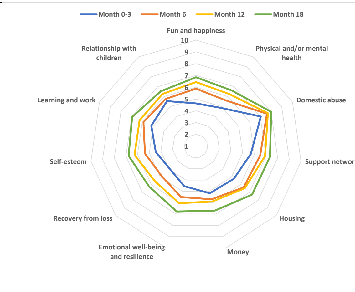
Pause progress tool scores at different stages of the programme