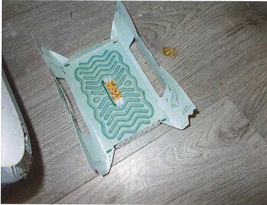
DHA-22-Photograph of clear sticky board