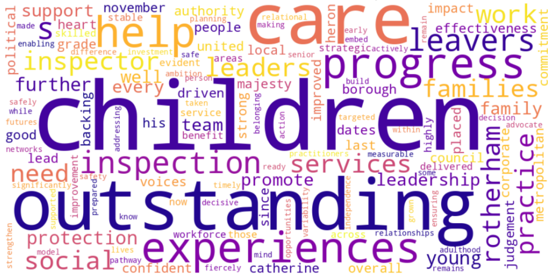
Word Cloud for All Words in Report